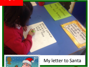
My letter to Santa

In Literacy, we heard the story of The Very First Christmas. We worked together to sequence the story using story cards. We then made our own Christmas story books by sticking the pictures in the right order and labelling them.