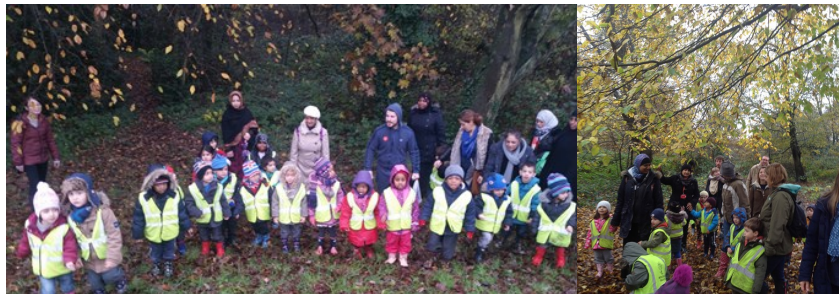
Acorn and Cherry Class get all muddy!

This week we went on a bear hunt in the forest, and we found a bear!!! We think it might have been a baby bear and mummy and daddy bear were still sleeping in their cave. We walked through lots of squishy, squashy mud! There was a swirling, whirling leaf storm and we saw some long grass.