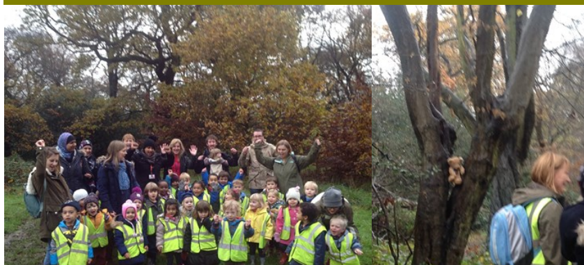
Acorn Class spot a bear in the trees!

This week we went on a bear hunt in the forest, and we found a bear!!! We think it might have been a baby bear and mummy and daddy bear were still sleeping in their cave. We walked through lots of squishy, squashy mud! There was a swirling, whirling leaf storm and we saw some long grass.