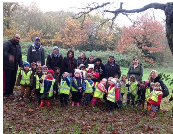
Cherry Class and their wellies!