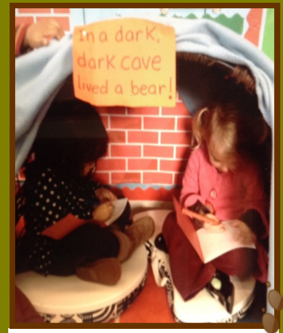
Acorn Children in their cave!

The children have been making swishy, swashy grass and bear footprints in thick, oozy mud. We are looking forward to more bear hunting next week!